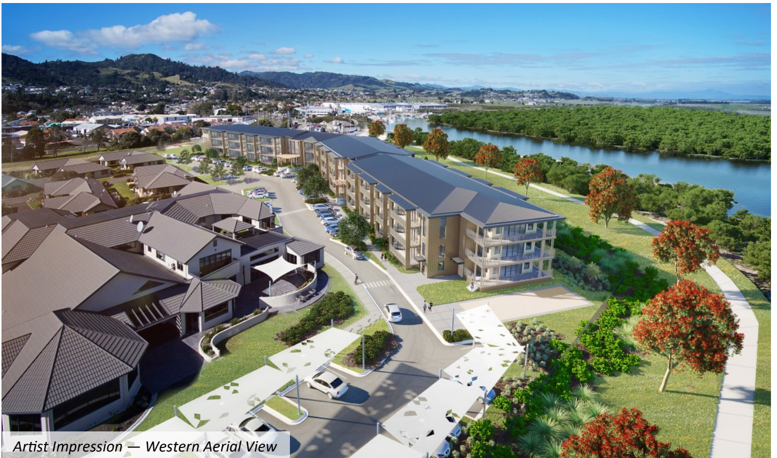
Artist Impression — Western Aerial View